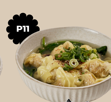
P11 WONTON 云吞板面 SOUP / DRY