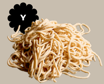
Y THIN 幼面