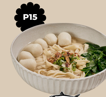
P15 FISH BALL 鱼丸板面 SOUP / DRY