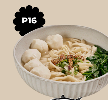
P16 CUTTLEFISH BALL 鱿鱼丸板面 SOUP / DRY