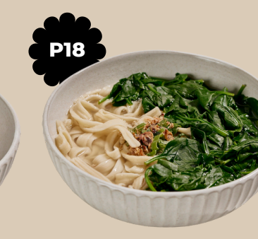
P18 VEGE PAN MEE 素板面 SOUP / DRY