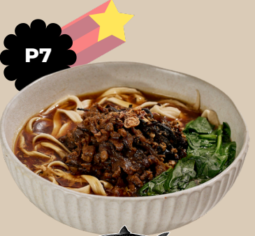
P7 LOR 卤汁板面