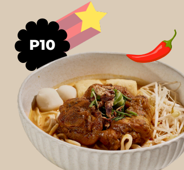
P10 CURRY LAKSA 咖喱板面 SOUP / DRY