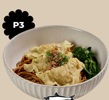
P3 CENTURY EGG DUMPLINGS 皮蛋饺板面 SOUP / DRY