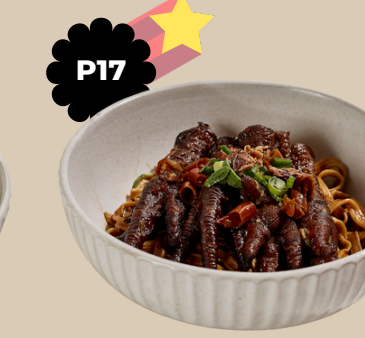
P17 BRAISED CHICKEN FEET 鸡脚板面 SOUP / DRY