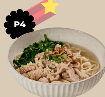
P4 JOJO'S PORK 生肉板面 SOUP / DRY