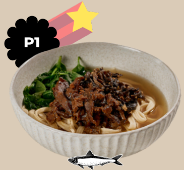
P1 TRADITIONAL 传统板面 SOUP / DRY