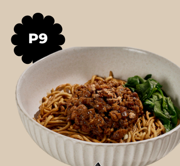
P9 MINCED PORK 肉碎板面 SOUP / DRY