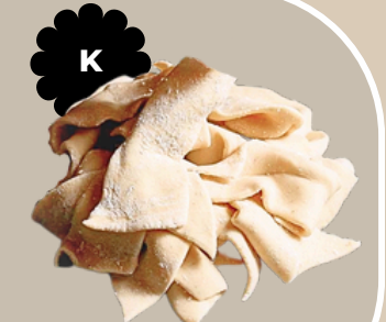
K CUT 切面

NOTE: IMAGES ARE FOR ILLUSTRATION PURPOSES ONLY