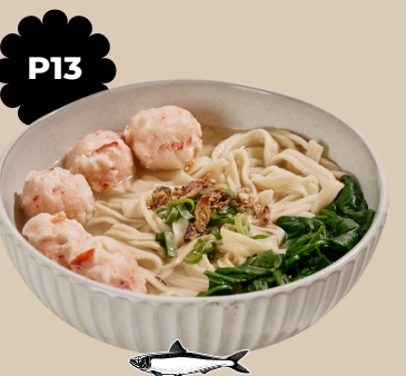
P13 LOBSTER BALL 龙虾丸板面 SOUP / DRY