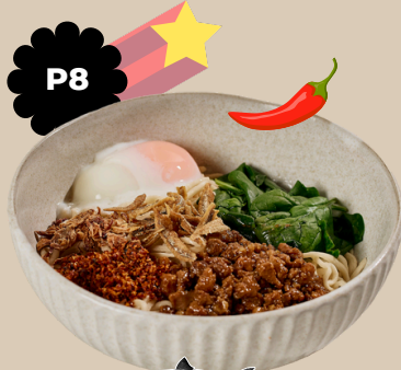
P8 LAT JIU 辣椒板面 DRY