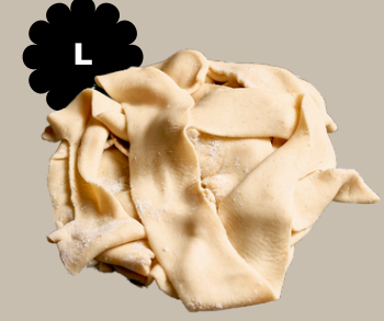
L WIDE 拉面