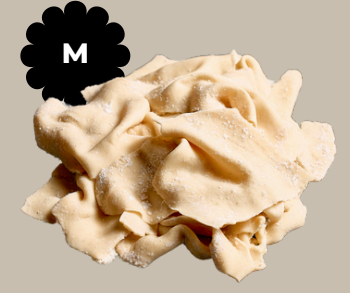
M TEAR 撕面