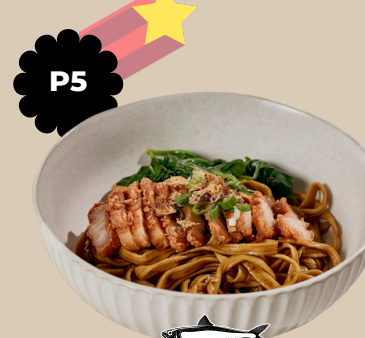
P5 FRIED PORK 炸肉板面 SOUP / DRY