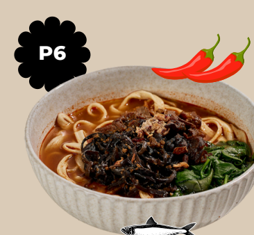
P6 HOT & SPICY 麻辣板面 SOUP / DRY