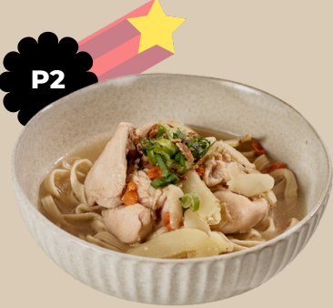
P2 HERBAL CHICKEN 药材鸡汤板面 SOUP