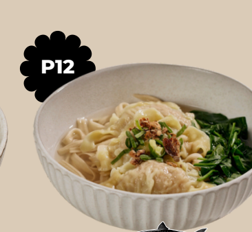
P12 PRAWN & PORK DUMPLINGS 水饺板面 SOUP / DRY