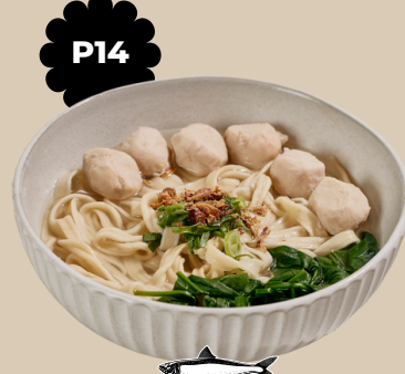
P14 PORKBALL / BEEFBALL 猪肉丸/牛肉丸板面 SOUP / DRY